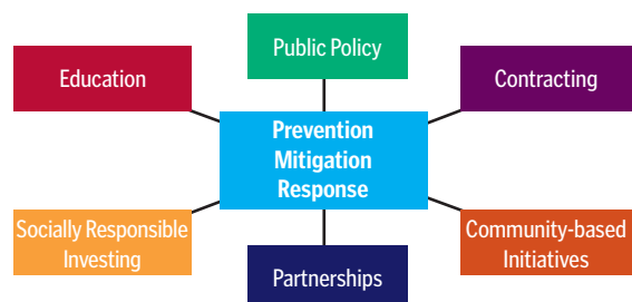
Human Trafficking: CHI’s Multifaceted Approach

CHI’s journey began simply, but it has grown and ultimately has developed into a multifaceted, organizational approach to mitigation, prevention and response. Components of the approach include education and awareness, public policy activism, socially responsible investing, contracting, community-based initiatives and partner collaboration. These efforts were created to assist local ministries and the greater provider community in addressing the devastating realities of persons who are trafficked.